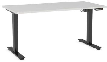
Agile 2 Column Electric Single Sided Desk