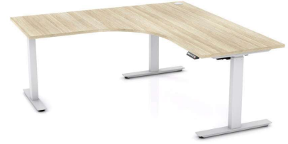
Agile 2 Column Electric 90° Desk