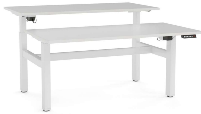
Agile 2 Column Electric Double Sided Desk