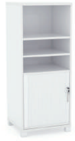
TOWER Bookcase + Tambour