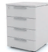
MOBILE 4 Drawer