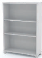
3 LEVEL BOOKSHELF 1250h x 900w x 300d