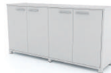
2 LEVEL CREDENZA 900h x 1800w x 400d