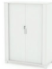
TAMBOUR 1250h x 900w x 450d