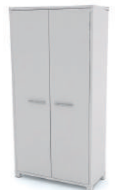
5 LEVEL CUPBOARD 1800h x 900w x 400d