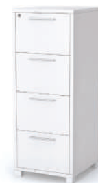
4 DRAWER FILING 1200h x 481w x 500d