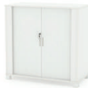
TAMBOUR 900h x 900w x 450d