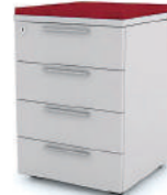
SEAT TOPPA 467w x 460d x 40h