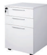
MOBILE 2 Drawer + File