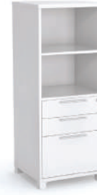
TOWER Bookcase + Drawers