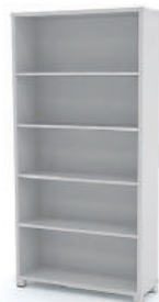
5 LEVEL BOOKSHELF 1800h x 900w x 300d mm