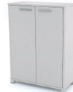
3 LEVEL CUPBOARD 1250h x 900w x 400d