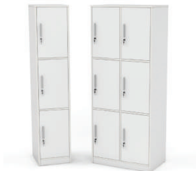
3 DOOR LOCKER 1800h x 380w x 450d