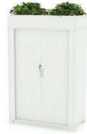
PLANTER BOX 150h x 900w x 450d 240h x 900w x 450d