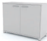
2 LEVEL CREDENZA 900h x 1200w x 400d