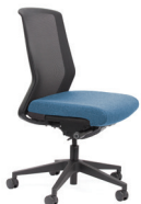
Motion Sync with optional seat cover